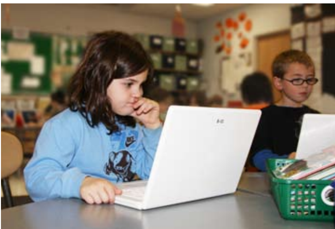
The overwhelming majority of the community indicate District 34 is working to achieve its mission of empowering children to be responsible learners and decision makers in a changing society.

The full executive summary of the survey results is available on our website at www.glenview34.org .