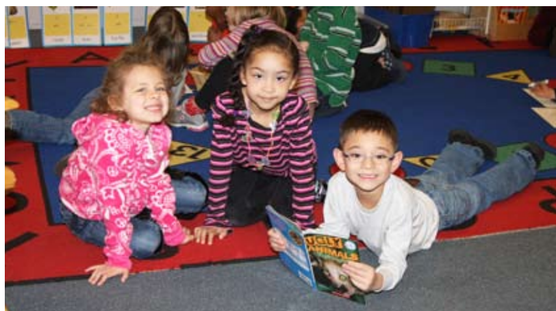
Kindergarten is a half-day program in District 34.